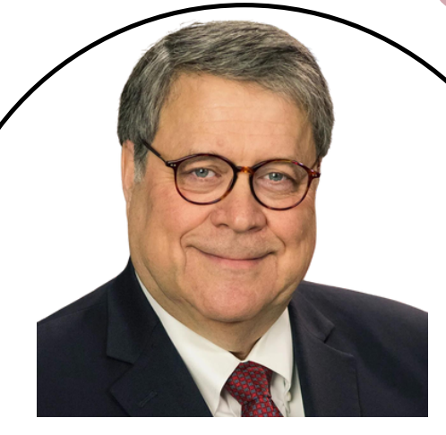
FORMER UNITED STATES ATTORNEY GENERAL WILLIAM BARR, KEYNOTE SPEAKER